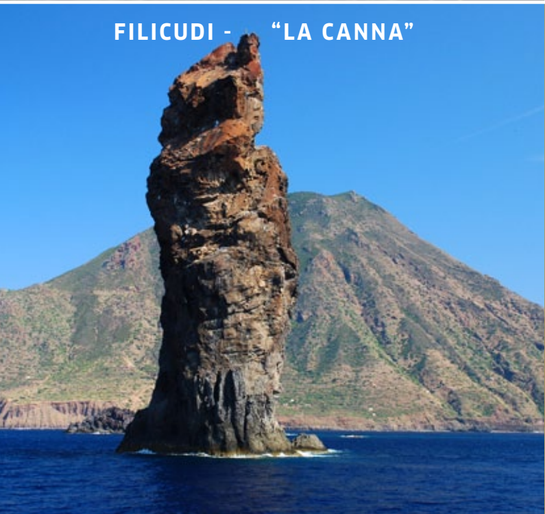
FILICUDI - “LA CANNA”

MINI CRUISE ISOLE EOLIE 7 DAYS / 6 NIGHTS